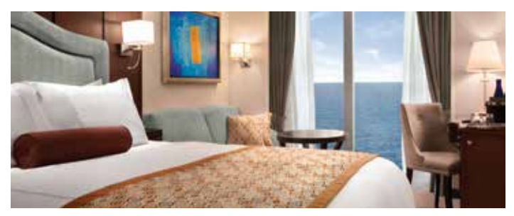
C | Deluxe Ocean View Stateroom

mini-bar and an oversized marble and granite-clad bathroom with a full-size bathtub/shower and separate shower. Guests also enjoy access to the private Concierge Lounge.